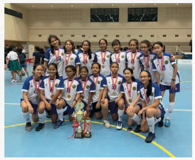
TK 'C' Division Floorball girls clinching the national champion for their fourth consecutive time!