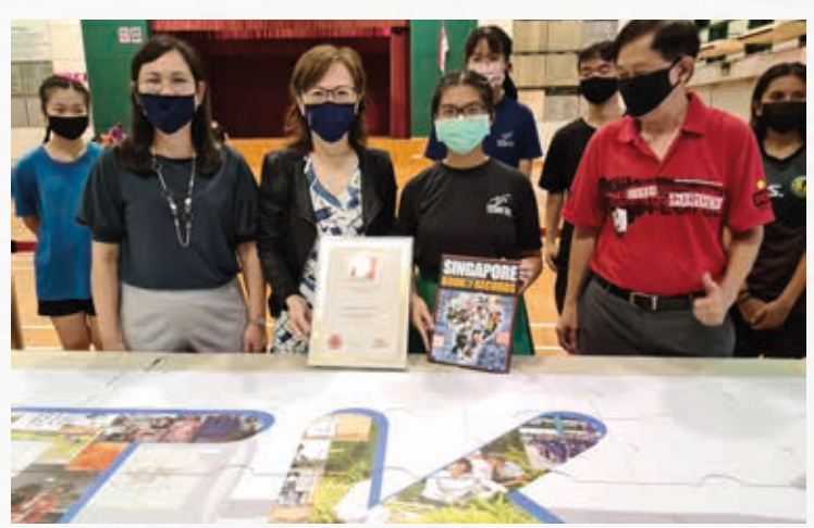
Pictures (from top left, clockwise): Sec 4 students playing Jenga; Racking their brains to solve the clues; the student organisers in front of the completed puzzle; Earning a place in the Singapore Book of Records; Piecing the puzzle togethe